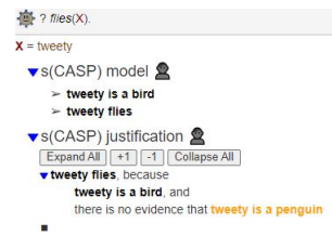
Figure 1: An English justification tree that tweety flies

flies(X) :- bird(X), not penguin(X). bird(tweety). #pred flies(X):: '@(X) flies'. #pred bird(X):: '@(X) is a bird'. #pred penguin(X):: '@(X) is a penguin'.